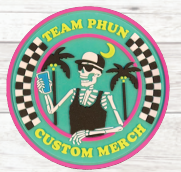
PVC / SILICONE